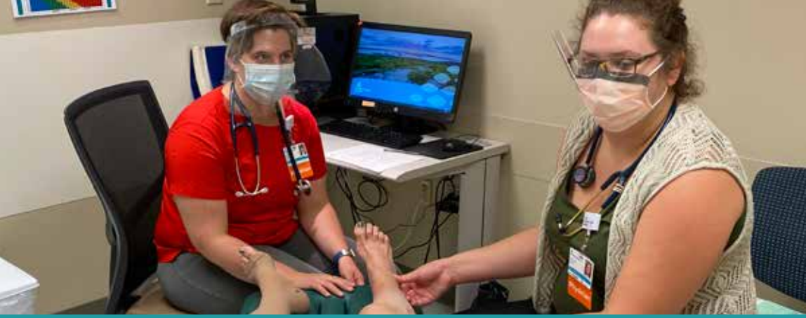
Osteopathic physicians interacting with a patient