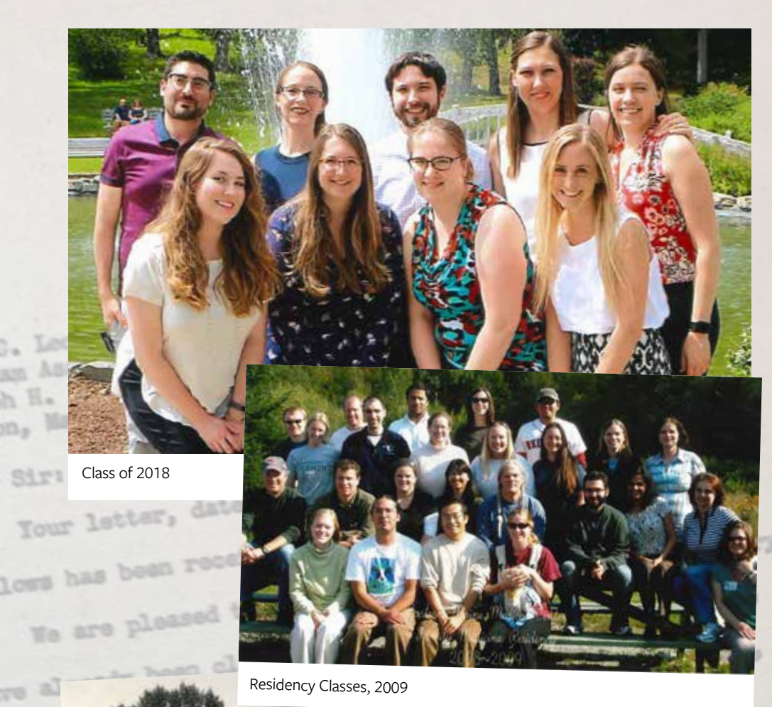
Residency Classes, 2009