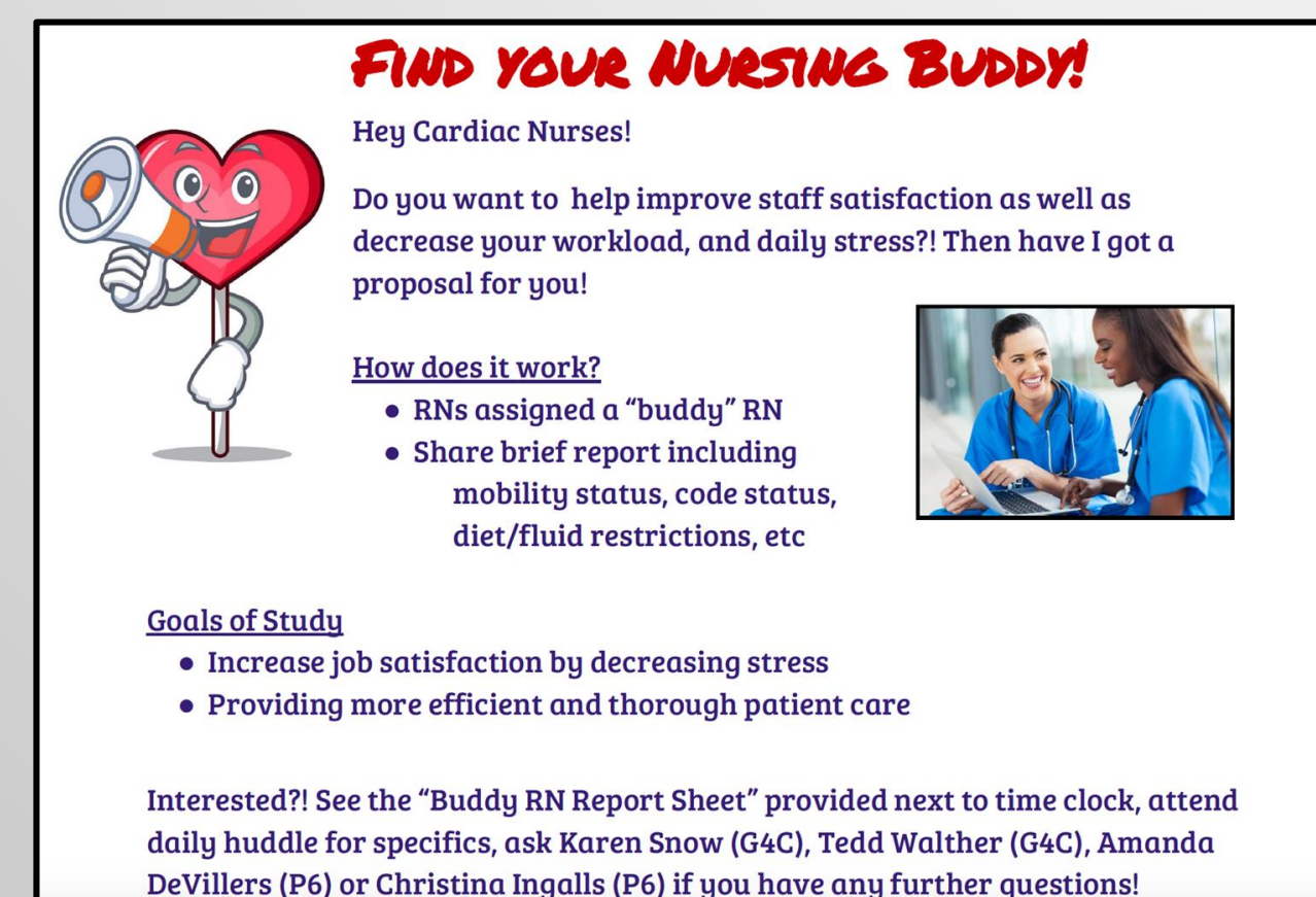
Recruitment flyer placed in various locations across both cardiac telemetry units

Buddy report sheet designed to standardize report for all participants